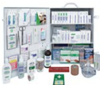
Art. No. 898.130025 Metal Case