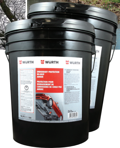
Art. No. 892.0801 (Amber) Art. No. 892.0802 (Black)

With today's climate change, it is necessary to provide underbody protection. Road salt, splashing water and aggressive chemicals as well as varying weather conditions will accelerate the use for vulnerable components such as the transfer case, fuel tank, etc. Corrosion can proceed in hidden places as well as those which are dented or chipped. Rust weakens the car's bodywork, severely affecting your driving safety, comfort, and spoiling the visual appearance of your car. Since cars are a major investment, it pays to protect them and enhance their resale value.